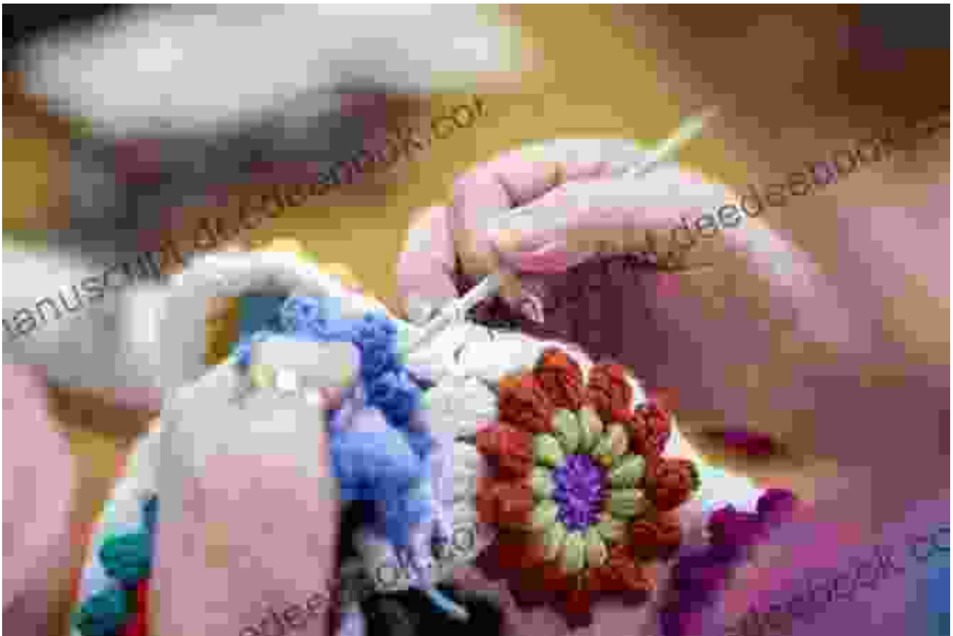
A group of Italian women knitting and crocheting together

The intricate lacework produced by Italian women was particularly prized. They used fine threads and delicate stitches to create exquisite lace garments, tablecloths, and curtains that showcased their patience and artistry.