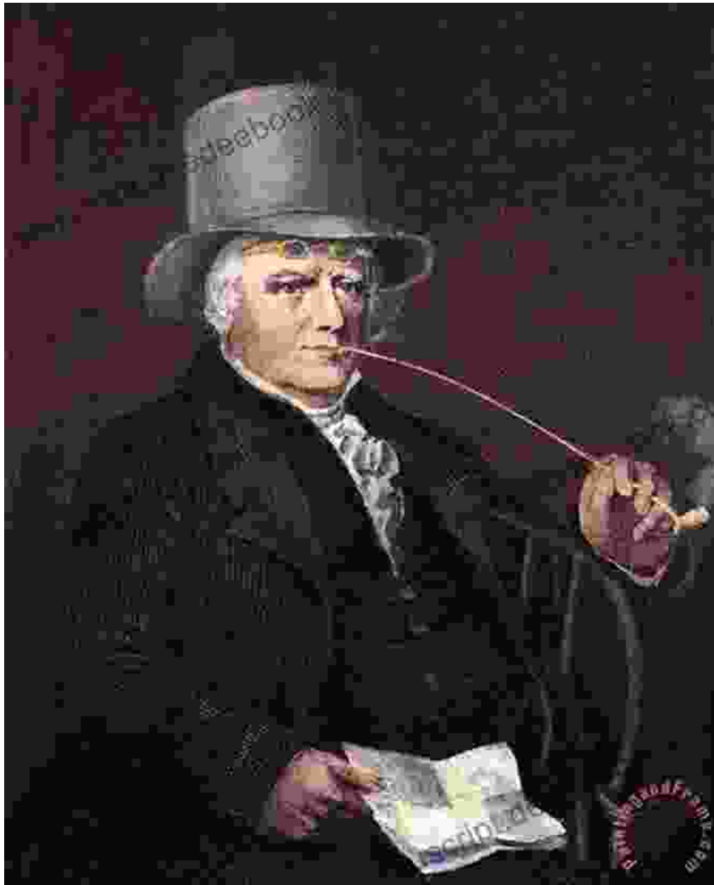
The Travels of Elkanah Watson: An American Businessman in the Revolutionary War, in 1780s