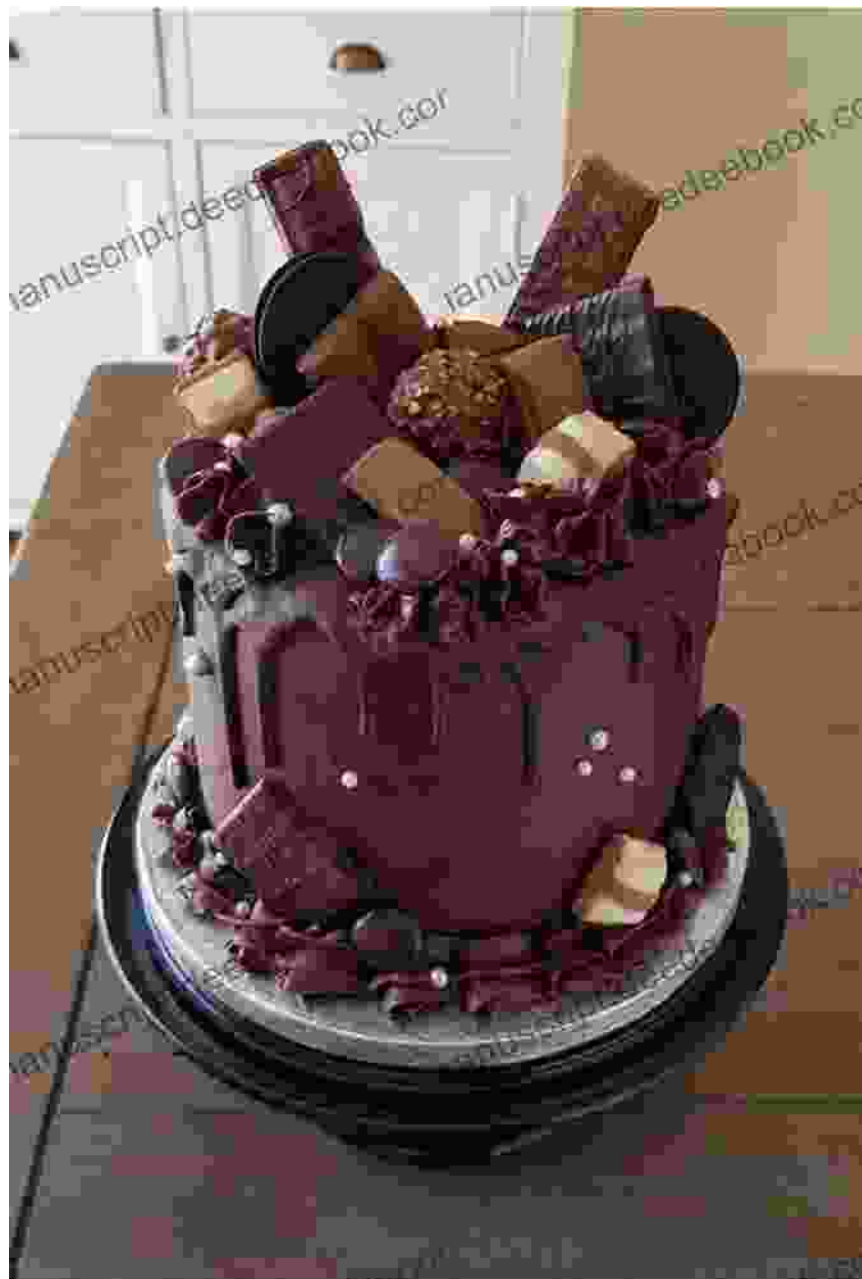
Igniting the Spark of Creativity

From classic wedding cakes adorned with intricate sugar flowers to whimsical birthday cakes that bring smiles to faces of all ages, the cake creations at The Chocolatier Cottage are sure to make any celebration truly special.