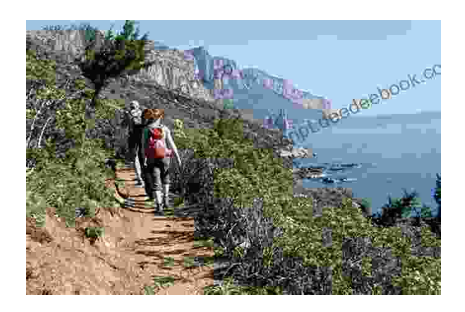
A beautiful hiking trail in Sardinia