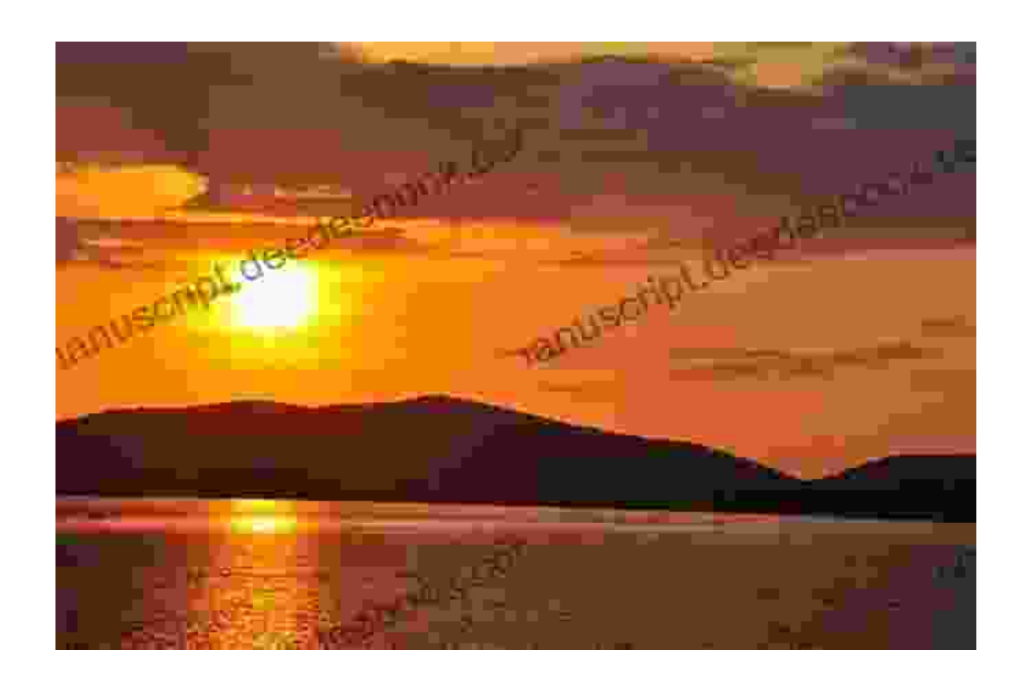
A stunning sunset in Sardinia