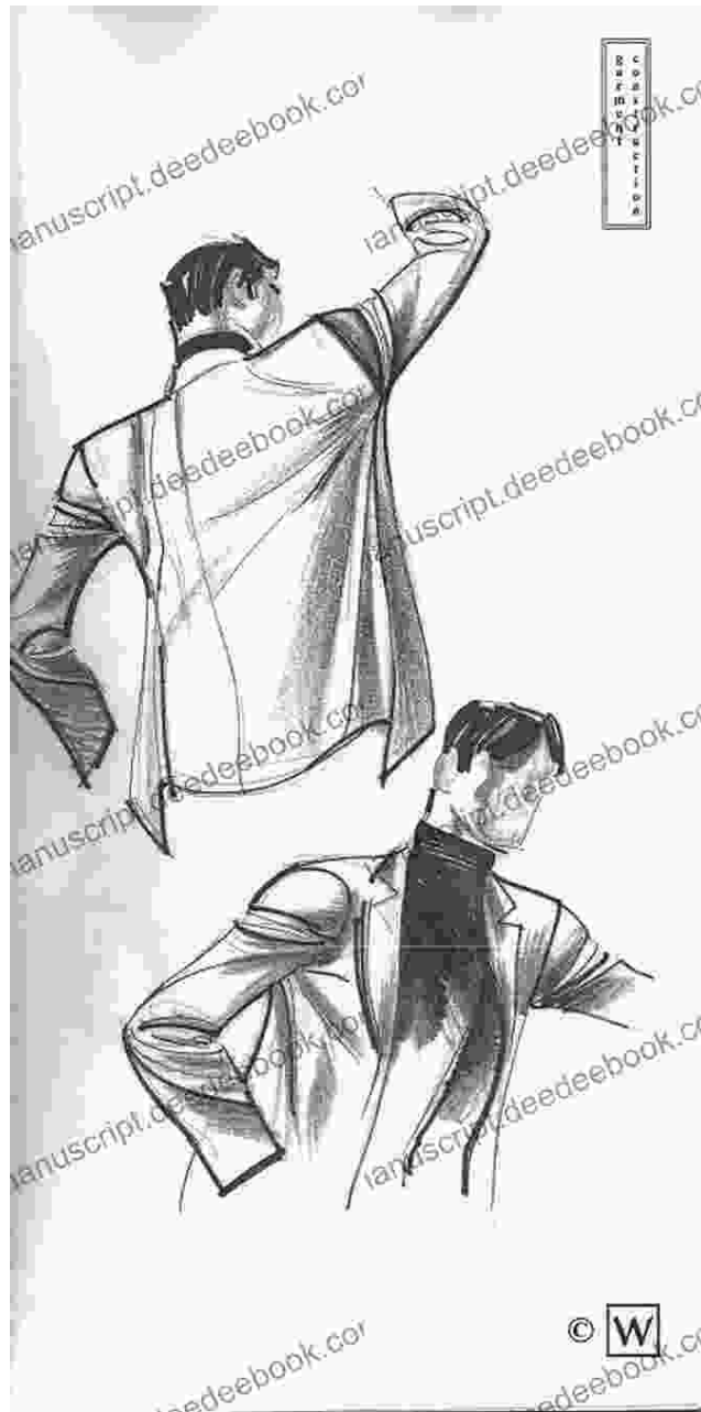
Jacket Pants by John Watkiss - Back View